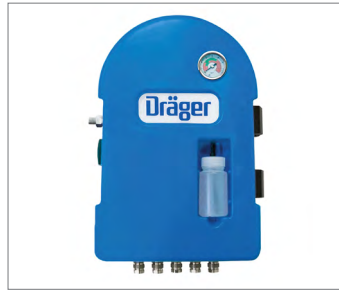
Dräger PAS Filter – wall-mounted