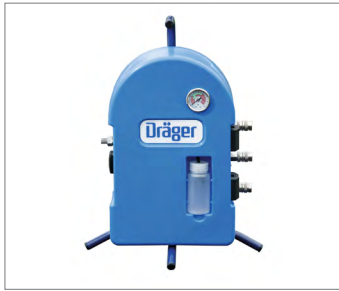
Dräger PAS Filter – portable